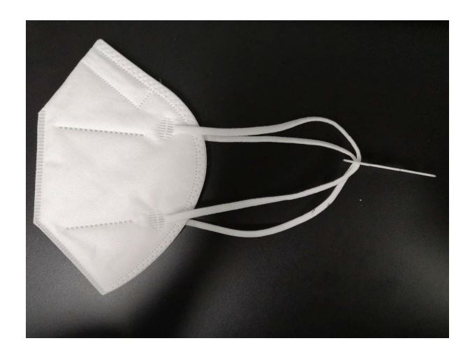
End of Annex B